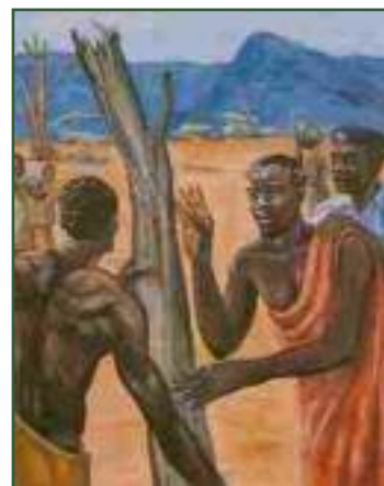
2 Jesus receives his cross

Stations of The Cross in an American Presbyterian church