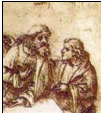
A preparatory sketch by Leonardo

Leonardo da Vinci painted this famous depiction of the Last Supper on a wall in the monastery of Santa Maria della Grazie between 1495 and 1498. It catches the precise moment described above. Jesus sits calmly in the centre watching the consternation he has caused. Each disciple reacts in a different way – dismay, anger, shock, even fainting. Some are asking for an explanation, Peter is thought to be holding a dagger, or is it just his eating utensil? All twelve have been identified from Leonardo's notebooks although it is difficult to identify each one simply by looking at the picture.