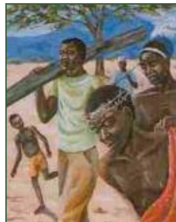
5 Simon helps Jesus to carry his cross