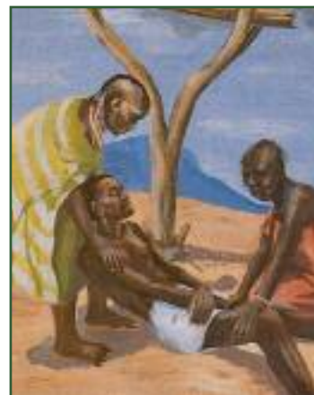
13 Jesus is taken down from the cross