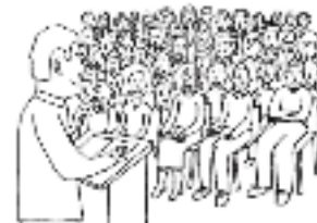
CHURCH MEETINGS ARE BRILLIANT

The Church Review is taking place with many in the church taking part – our findings will be brought together at a gathering at Tockington Methodist Church on February 25th.